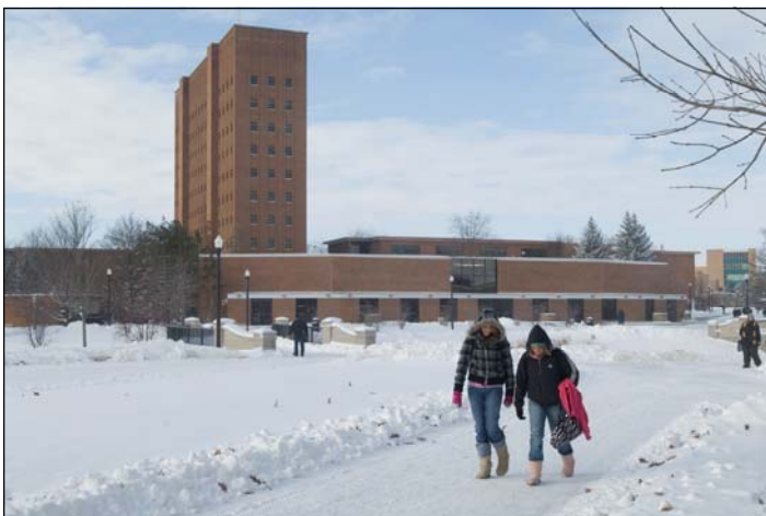
Cole Hall (the single-story building pictured in the background) was the site of a shooting in which five students were killed at Northern Illinois University in DeKalb in February 2008.

Questions are turning into solutions as NIU officials continue to work toward further securing the campus for anything that might arise in the future. The school has received some grants to help make the campus among the safest in the state, if not the country. Questions asked and solutions developed may provide a basic outline for others responsible for protecting hundreds or thousands of people.